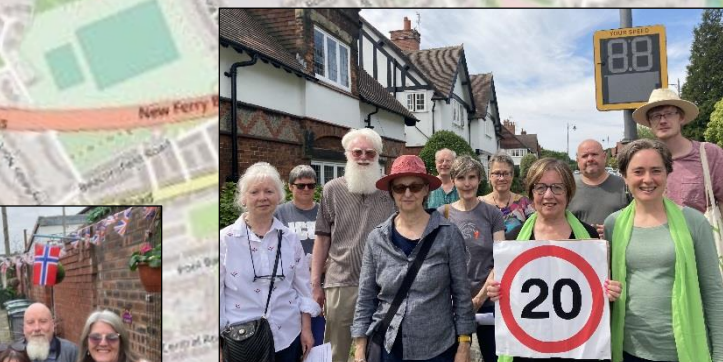
Working with people and making our streets safer for everyone