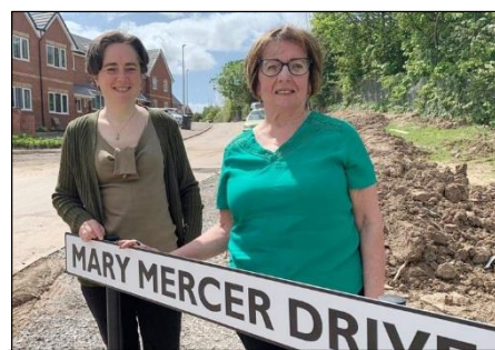
Recognising amazing women of the past in new street names