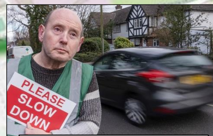
Highlighting road danger and taking action