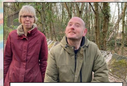
Protecting our heritage like this repaired sandstone wall