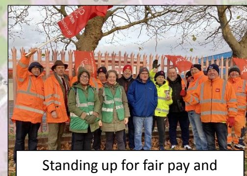
Standing up for fair pay and decent working conditions