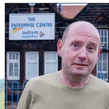
We need more people on the council like Kieran speaking up for people with disabilities