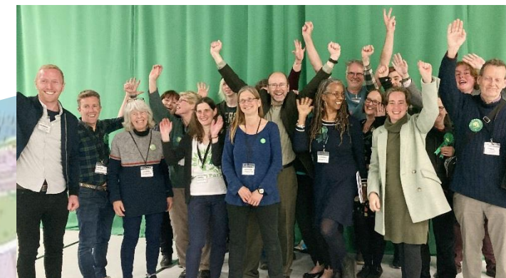
Greens are easily the fastest growing party in Wirral – 9 councillors and counting