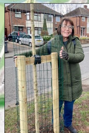
Supporting nature and biodiversity, tackling climate change