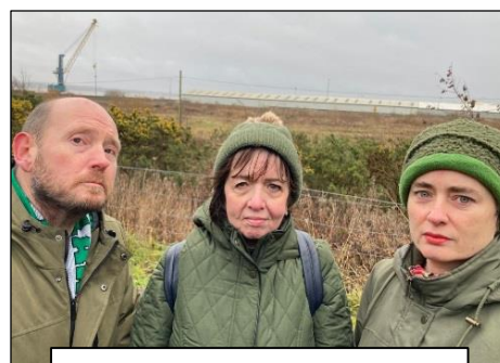
Helping our community to challenge planning applications