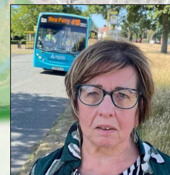
Pressing for better bus and train services