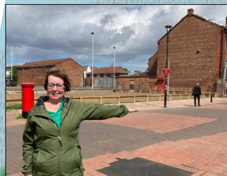
Fighting for justice and supporting the regeneration of New Ferry