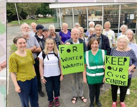
Supporting the most vulnerable in our community