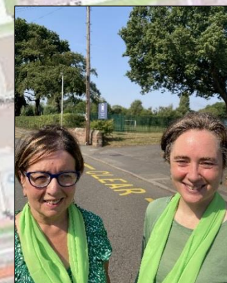
Reporting over 1,000 issues in three years to improve our streets and services