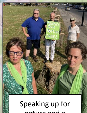
Speaking up for nature and a greener future