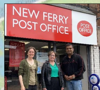
Supporting local business