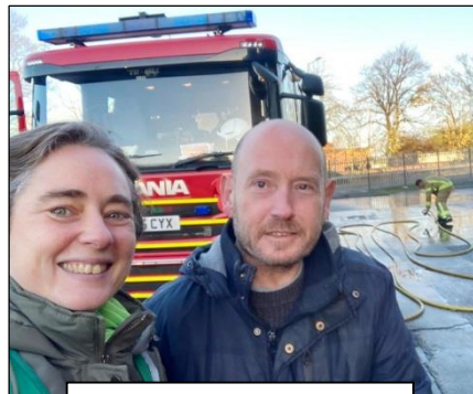
Supporting vital public services