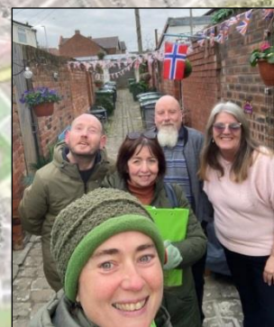
Supporting community action